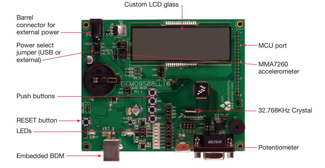
Figure 1. DEMO9S08LL16